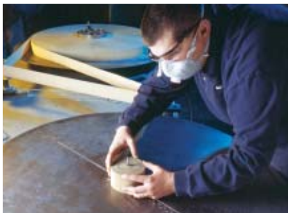
►MIRATECH Catalyst Manufacturing Better Designed, Better Built.

Because there's excess air in the lean-burn fuel mix and exhaust stream, bringing oxides of nitrogen down to compliance levels requires a system specially dedicated to the job: the MIRATECH SCR system.