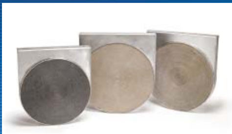
▶MIRATECH's Flat-Top Bonnet™ Design Your Best Bet For HAPs Compliance

If you operate engines – rich-burn or lean-burn; natural gas, LPG, diesel, or dual-fuel – falling under the HAPs rules, non-compliance can pose hazards to your cash flow, profits and peace of mind.