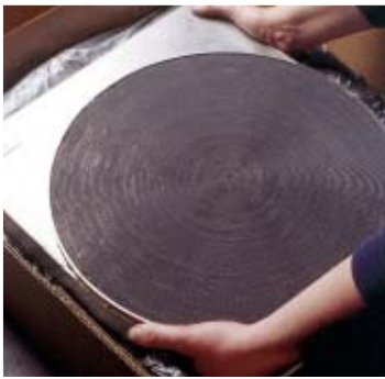
» Diesel Oxidation Catalysts Your Best Bet for Diesel Compliance

If you run stationary diesel engines, it's a safe bet you're generating more than power. Diesels produce carbon monoxide (CO), soot, volatile organic compounds (VOCs) and other hazardous air pollutants (HAPs), sulfur acids, odor, and more. That means health risks – and strict environmental regulations.