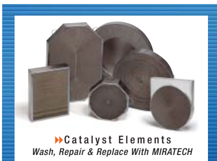
»Catalyst Elements Wash, Repair & Replace With MIRATECH

Why MIRATECH replacements? Simple: They're better designed and better built. So they work harder – with less trouble, less maintenance, and less life-cycle cost.