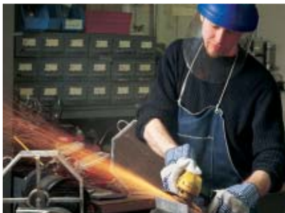
▶MIRATECH Catalyst Manufacturing Better Designed, Better Built

If you run rich-burn stationary natural gas- or propane-fueled industrial engines, you face tough compliance rules – and stiff non-compliance fines – covering three types of exhaust emissions: carbon monoxide (CO), oxides of nitrogen (NOx), and hydrocarbons (HCs) including volatile organic compounds (VOCs) and a long list of EPA-classified hazardous air pollutants (HAPs).